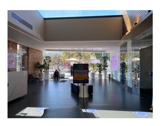
Entrance to New City Medical Plaza