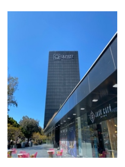
Quartz Hotel – Adjacent to New City Medical Plaza