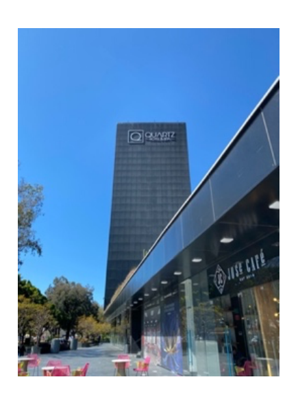
Quartz Hotel – Adjacent to New City Medical Plaza