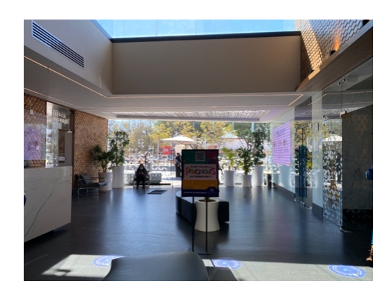
Entrance to New City Medical Plaza